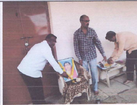
Worshipping image of Savitribai Phule by Students & Staff